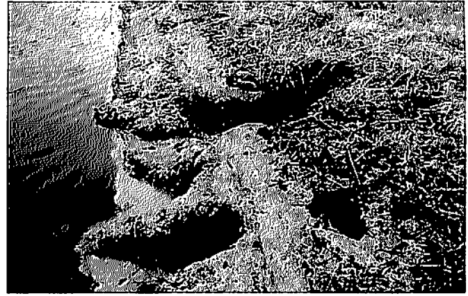
Figure 2. This neglected lagoon shows animal damage and poor grass care.

water and the health of perennial grass on the lagoon embankment (berm). Is more frequent mowing needed to keep the grass no taller than 6 or 8 inches on the inside slope?